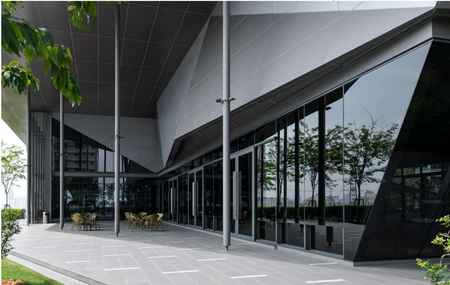
Shady and double-volume chill-out lounge at Club House

Further keeping to the concept of the lake, the 4-storey link bridges that link each tower to the recreational podium are “skinned” with semi-transparent aluminium perforated panels of water ripple movement pattern. True to its name, the residential towers rise to a commanding height above the scenic surrounding lake. Its architectonics link the clouds with the nearby lake, and each tower is integrated with reinforced concrete “tapestry” flickering in the breeze of the lake.