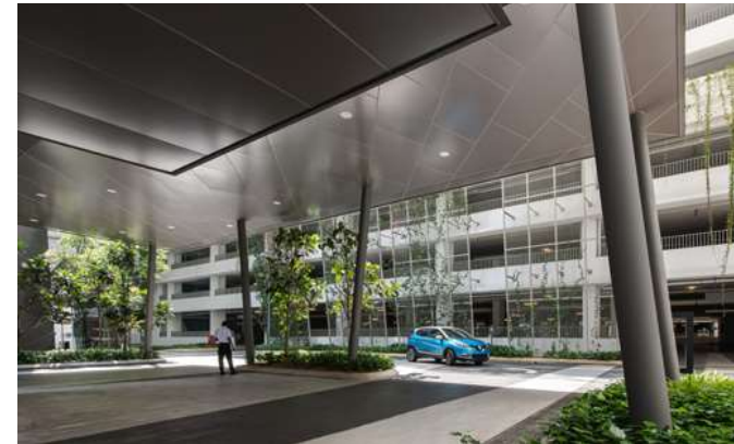
Ceremonial entrance with leaning poles, portal with diagonal ceiling

The expansive recreational park is complemented by lush tropical landscaping to create visual focal points, serving as a unifying feature between the landscape and architecture. It also included a 0.5km jogging track that winds its way through the green environment. In addition to the jogging track, there is a Club House of faceted façade comprises of Multi-Purpose Hall, Gymnasium, sports and health facilities, 50m infinity swimming pool, wading pool, ecosystem pond, chill-out lounges, Hammock Garden, Sunken Plaza and so on. Residents can enjoy and appreciate the breeze and bustling view of the Kuala Lumpur cityscape.