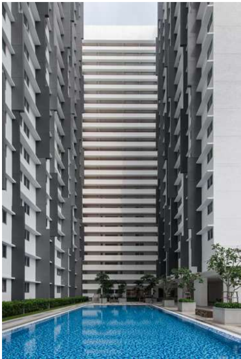
Juxtaposition between linear corridors and rows of reinforced concrete louvres at Seri Wahyu Apartment for Residensi Wilayah Keluarga Malaysia (RUMAWIP)