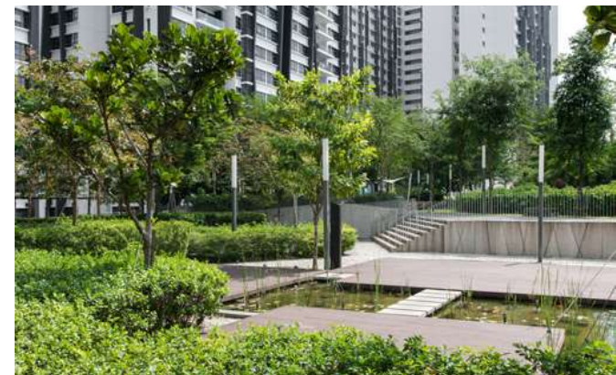
Ecosystem pond with lush tropical landscaping given the pristine environment