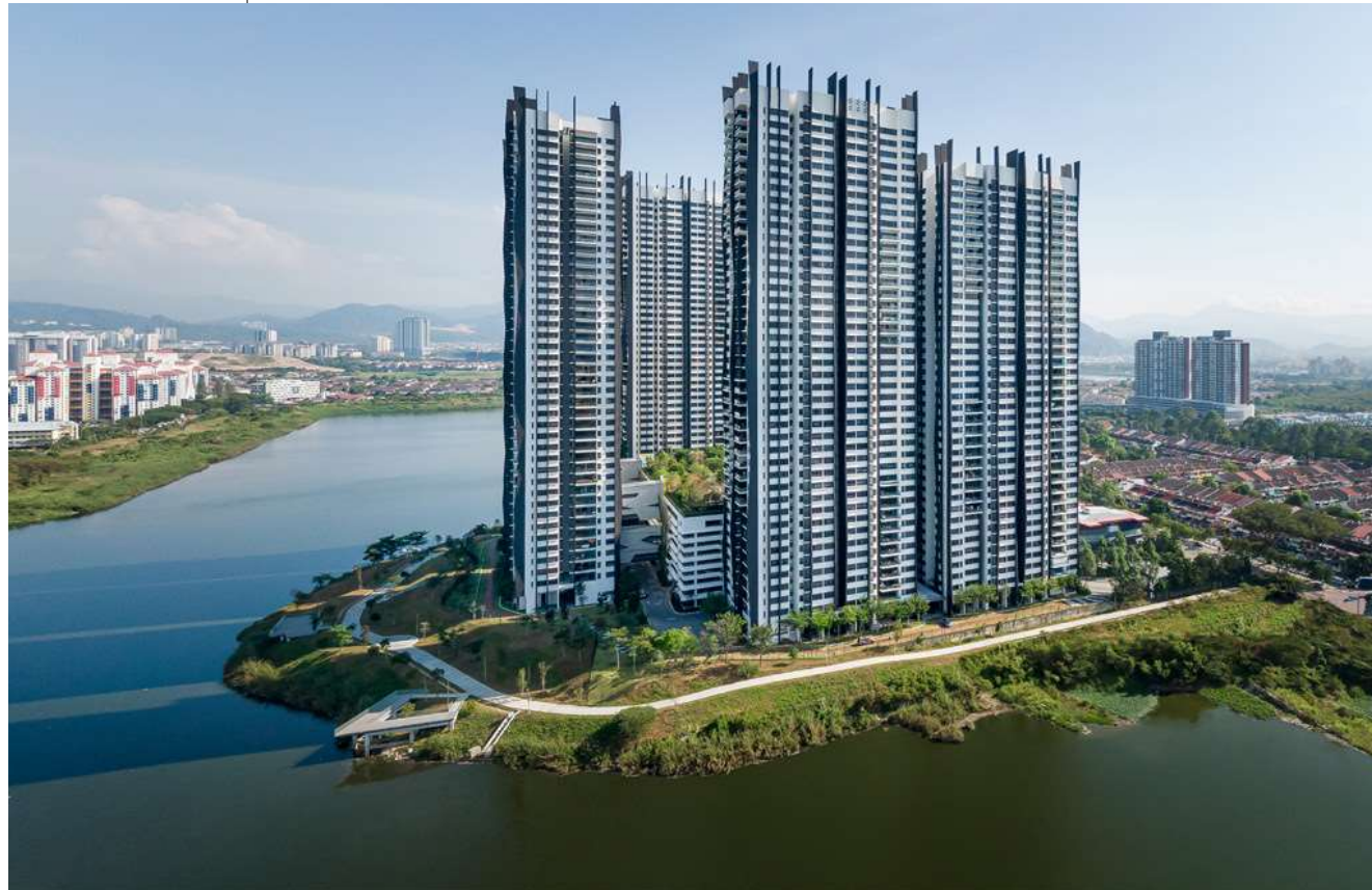
View from South West, 0.5km jogging belt and viewing decks by the lake, residents enjoy panoramic views of the lake, surrounding lush environments and bustling city views.

Inspired by the lake, the façade of the building reflects the pattern of rippled water through rows of reinforced concrete fins that stretch throughout the building height and flicker in the breeze of the lake.