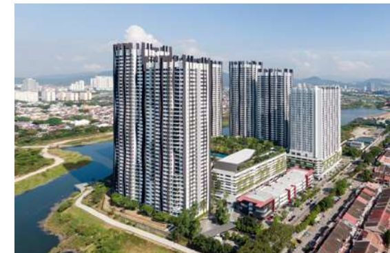
View from South East, Lakeville Residence comprises serviced apartments, apartment for Residensi Wilayah Keluarga Malaysia (RUMAWIP) and niche retail shops.

Inspired by the lake, the façade of the building reflects the pattern of rippled water through rows of reinforced concrete fins that stretch throughout the building height and flicker in the breeze of the lake.