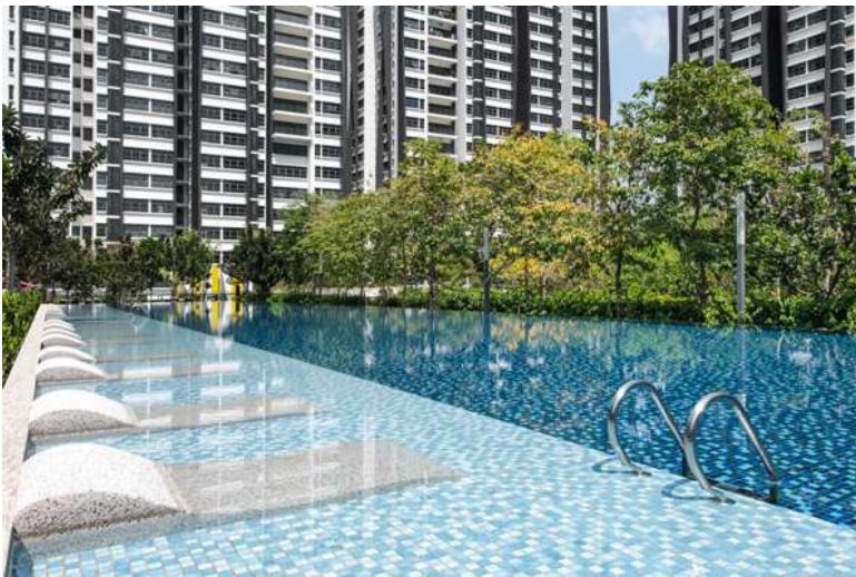
50 metres length infinity pool overlooking lush tropical landscape and residential towers

Lakeville Residence includes one of KL's largest recreational parks – a 1.25-hectare facility podium offering a treasure trove of facilities for family enjoyment