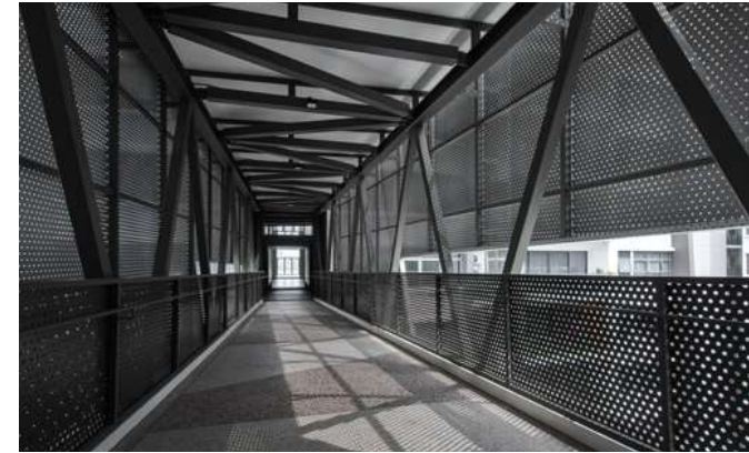
Link bridge connecting residential towers to recreational facility podium