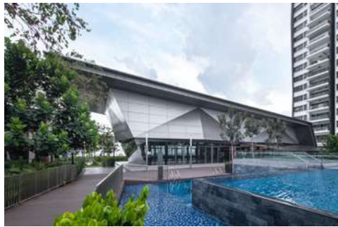
Lush curtain creepers dangling down into void space shades the carpark floors

Lakeville Residence includes one of KL's largest recreational parks – a 1.25-hectare facility podium offering a treasure trove of facilities for family enjoyment