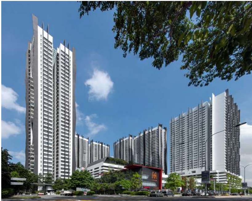
View from Jalan Sibul, the formal entrance to Lakeville Residence is beside the niche retail shops.

The final design is the result of intensive studies about tower placement, orientation and massing. Contemporary development demands necessitate height and density. Inspired by the lake, the façade of the building reflects the pattern of rippled water through rows of reinforced concrete fins that stretch throughout the building height and flicker in the breeze of the lake.